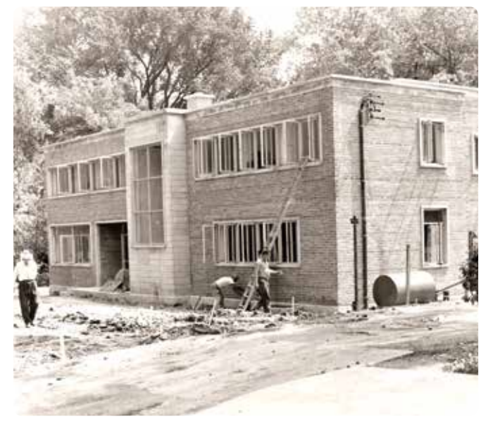
Workers put finishing touches on the building in 1957