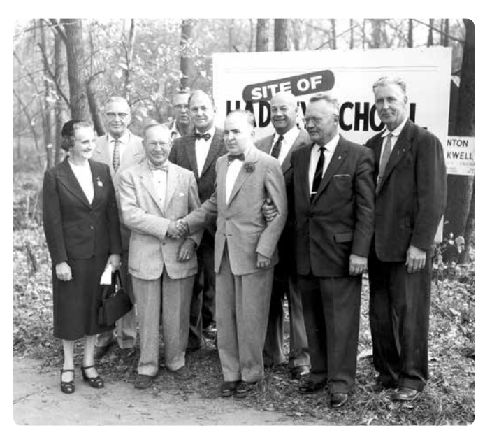
The site of Hadley headquarters in 1956

The original Hadley building was state of the art when completed in 1957. However, it was time to update our mechanical infrastructure, make the building ADA compliant and reimagine spaces to support our current and future needs. Our recent remodel is within the same footprint as the original structure, but with innovative solutions to add space, increase light and improve the work environment.